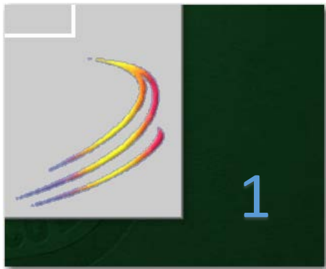
FIGURE 1 - WINDOWS 10 DESKTOP